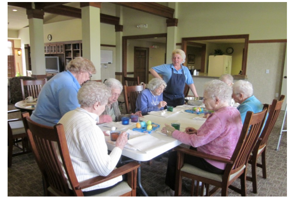
Coloring Easter Eggs

We will be drawing a recipe from each category and that individual will receive a cook book along with an invitation for four people to have lunch at River Bend Retirement Community. The Recipe will also be featured in our Monthly Newsletter in the coming months.