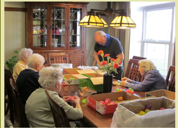
Filling Easter Eggs

for the River Bend Retirement Community Cook Book